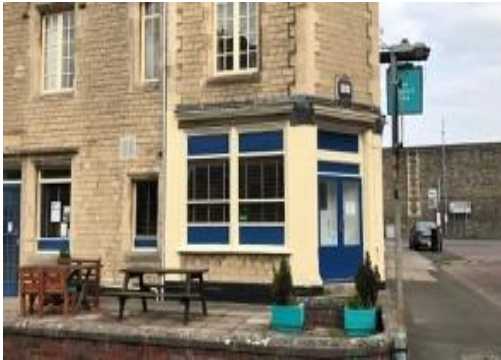
The Bakers Café – home to We're Open

We're Open is a weekly café which had been postponed from February 2020 due to the impact of the covid lockdown. As restrictions began to be lifted, we recognised the need for the project to be re-started. In May 2021, We're Open was relaunched in a new location, the Bakers Café in the historic Railway Village on the edge of Swindon town centre.