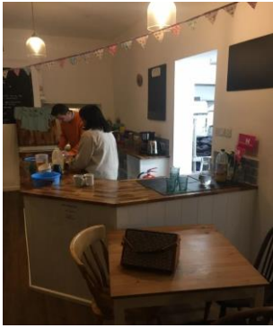
Volunteers serving at We're Open