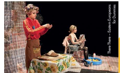
There There – Eastern Europeans for Dummies

Driftwood – Faceless Arts: Driftwood is an outdoor performance and visual arts workshop which explores how communities welcome newcomers and offer sanctuary. There will be a hands-on flag making workshop, followed by a promenade performance around the city, ending with a 'welcome' celebration back at its initial starting point.