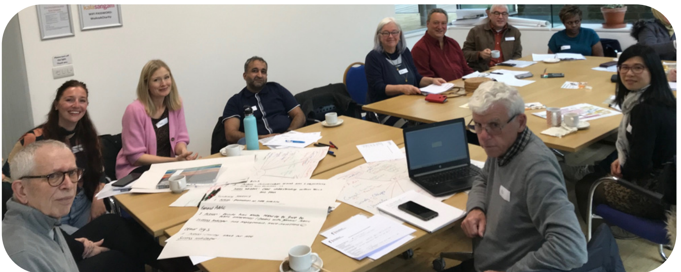
Trustees, Staff and our Advisory group at our Annual Planning day in February.

In the coming year this group will be a key driver in our development. We are really excited to see how it develops and to learn from the experience of those with lived experience of seeking sanctuary."