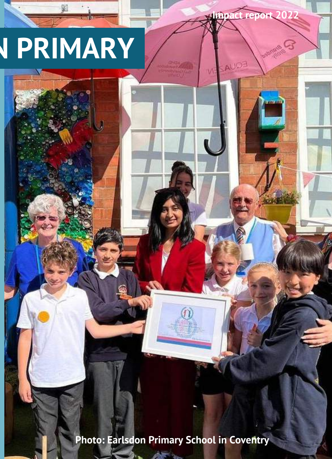
Photo: Earlsdon Primary School in Coventry

For their award ceremony, pupils explained to their local MP about why they have become a School of Sanctuary and about how they think people seeking safety should be treated with compassion and kindness.