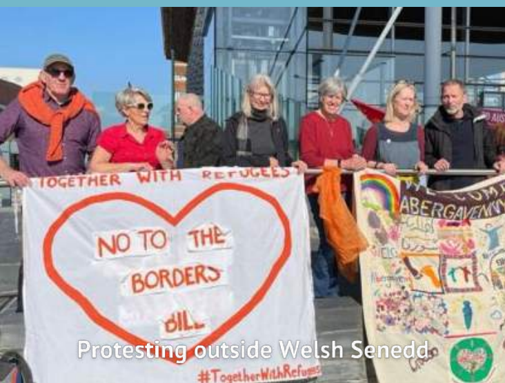
Protesting outside Welsh Senedd

We have continued to work with the coalition on our aim for Wales to be a Nation of Sanctuary. There are now 24 awarded schools, with Cardiff City Council aspiring to have all schools awarded over the next three years. We have now partnered with the Church in Wales to work towards all their schools getting sanctuary status. Cardiff University and Cardiff Met have been re-accredited as Unis of Sanctuary.