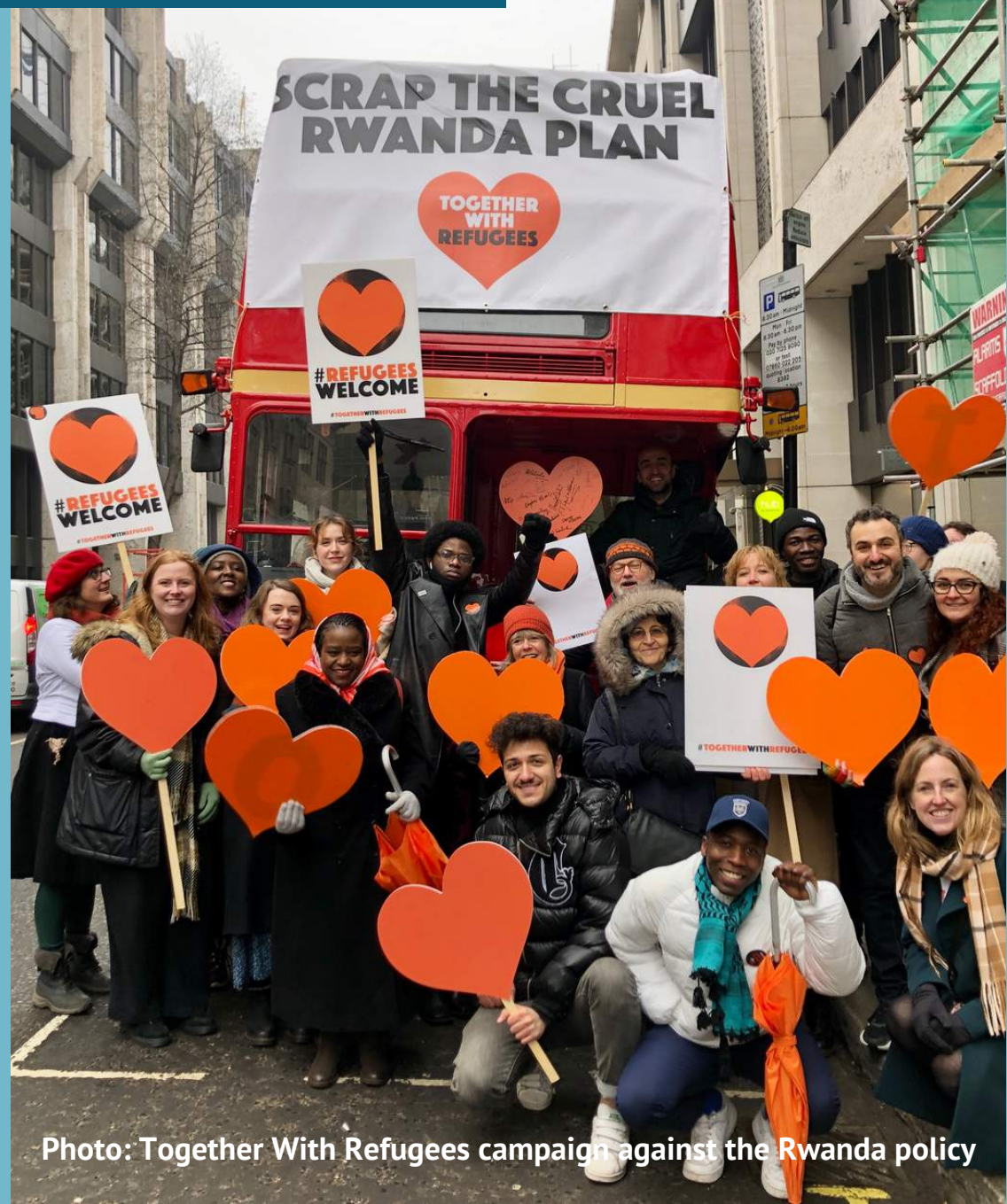
Photo: Together With Refugees campaign against the Rwanda policy

We continue to be active members of the campaign coalitions, Detention Forum, challenging the UK's use of immigration detention; Lift the Ban, campaigning to give people seeking asylum the right to work; and Families Together, fighting for more refugee families to be reunited in the UK.