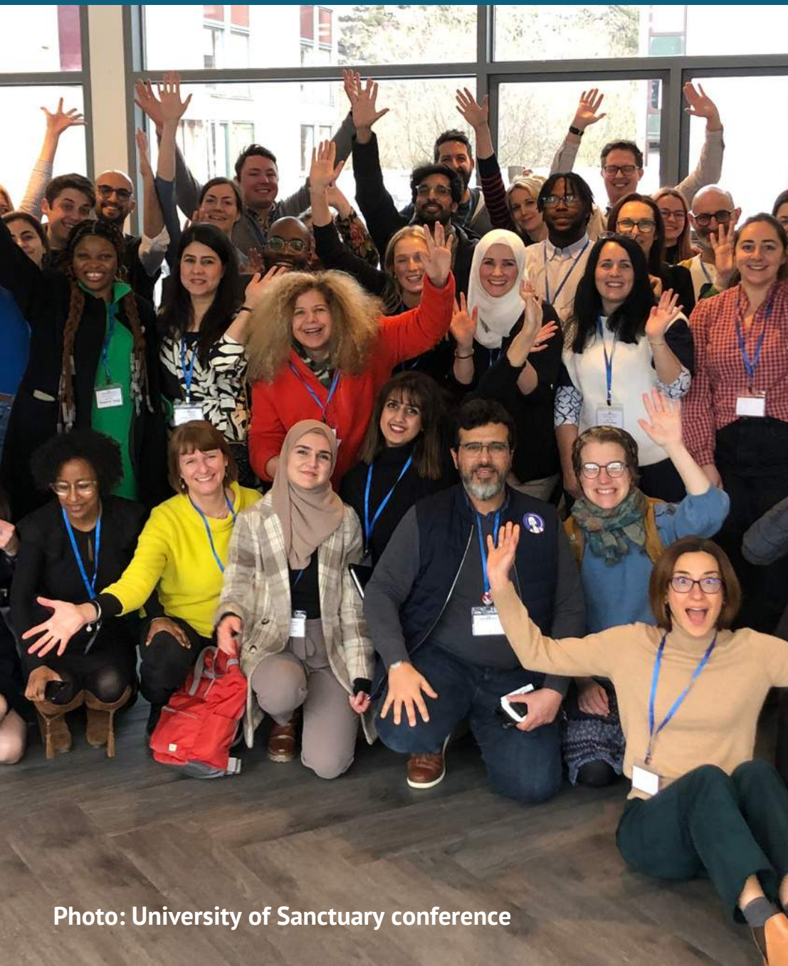
Photo: University of Sanctuary conference

Across the UK there are now sixty universities who either have the University of Sanctuary award or are working towards it. That's well over a third of all UK universities. The impact of this is huge.