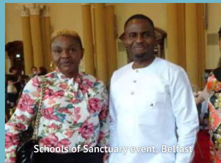
Schools of Sanctuary event, Belfast

Following a conference organised by Belfast City of Sanctuary, Belfast City Council voted to officially become Local Authority of Sanctuary. Other local authorities in Northern Ireland are keen to follow suit - we look forward to developments in 2023. After years of successfully delivering Schools of Sanctuary Awards, interest in Universities, Colleges and Libraries streams are also now growing.