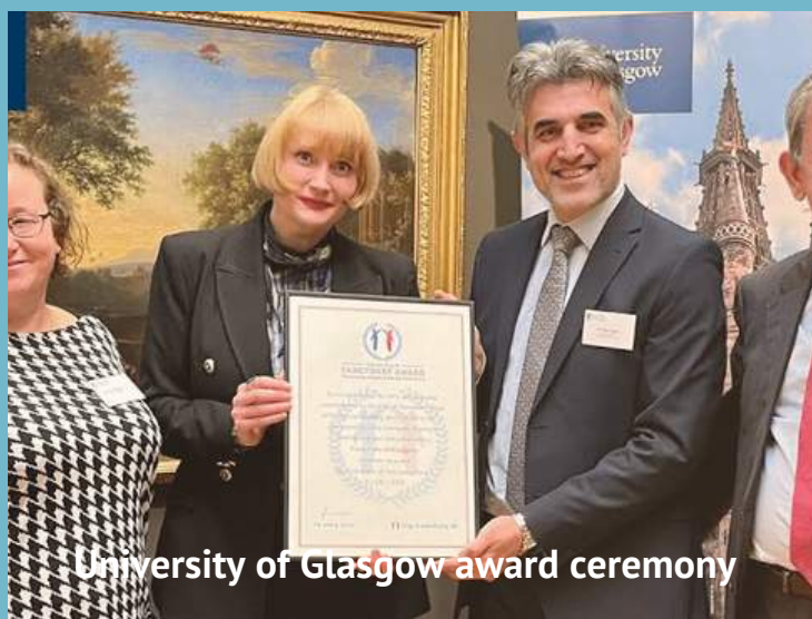
University of Glasgow award ceremony

Two more Scottish unis have been awarded this year, bringing the total to four. Lochardil Primary School in Inverness was recognised as Scotland's first School of Sanctuary, celebrated with a motion tabled by their MP. This year we were delighted to have been hosted by SCAPP, CILIP Scotland and CDN to speak about ensuring unis, libraries and colleges are welcoming spaces for people seeking sanctuary.