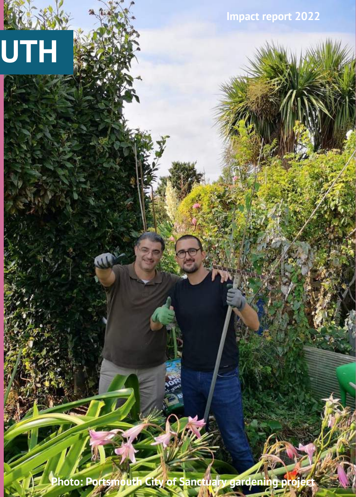
Photo: Portsmouth City of Sanctuary gardening project

The group also ran a community Jubilee Concert and hosted visits from their local MP and councillors.