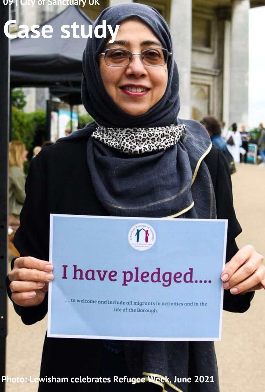
Photo: Lewisham celebrates Refugee Week, June 2021