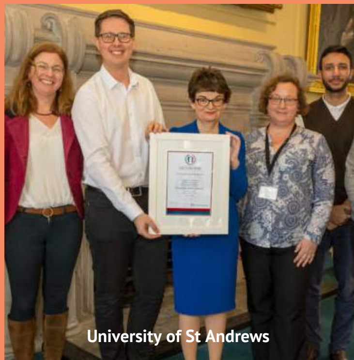
University of St Andrews

We have worked with the Scottish Refugee Council to develop specialist training for universities. This year saw University of St Andrews welcome its very first cohort of Sanctuary Scholarship holders, University of Edinburgh has been re-accredited, whilst four more Scottish universities are working towards the award.