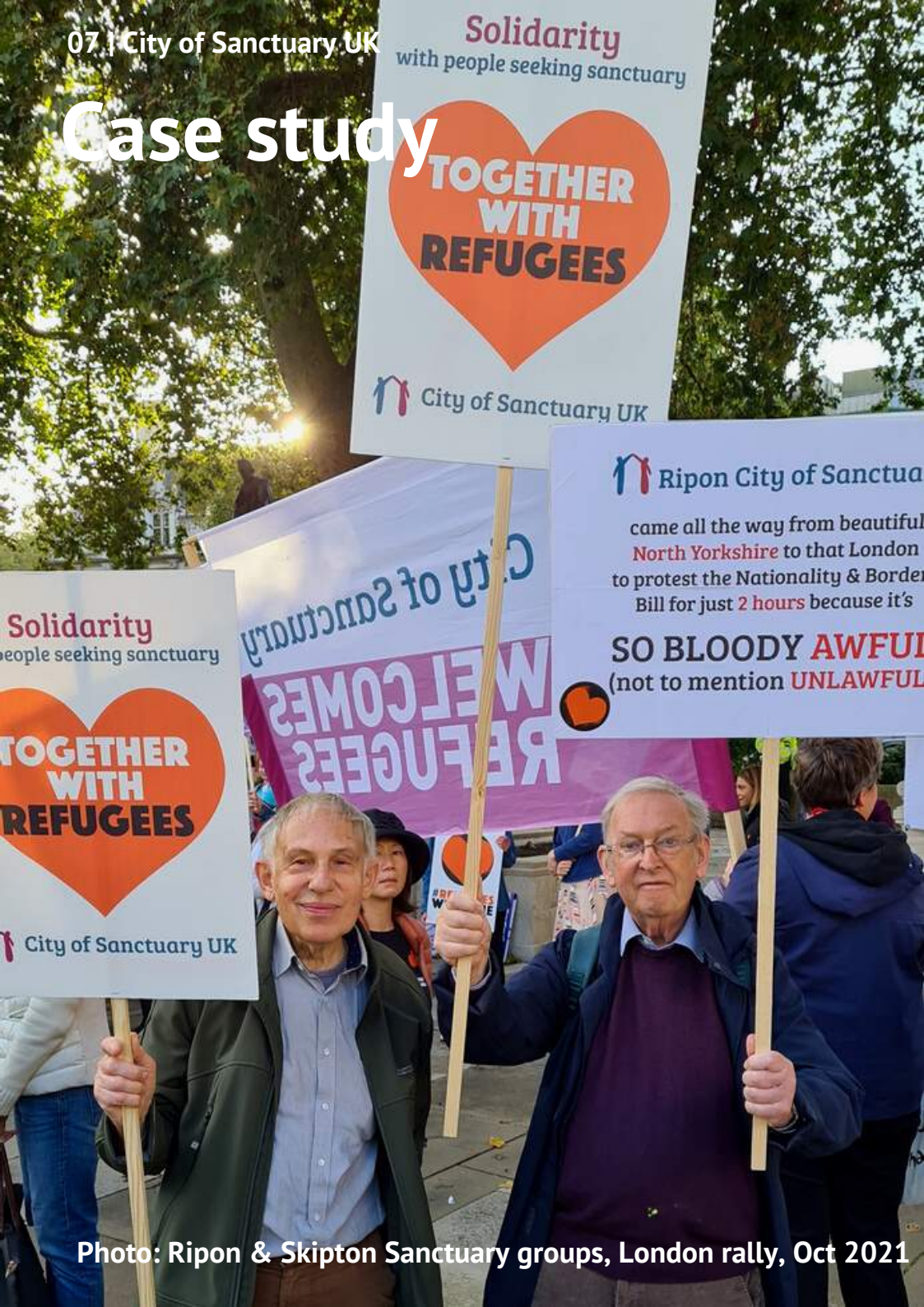
Photo: Ripon & Skipton Sanctuary groups, London rally, Oct 2021