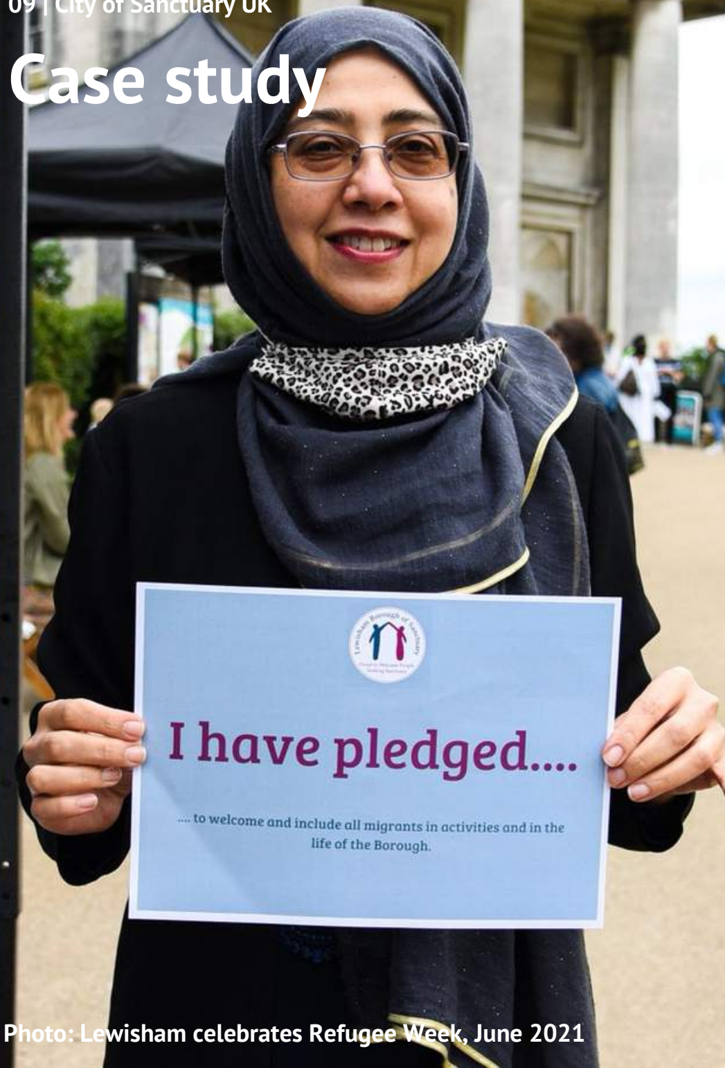
Photo: Lewisham celebrates Refugee Week, June 2021