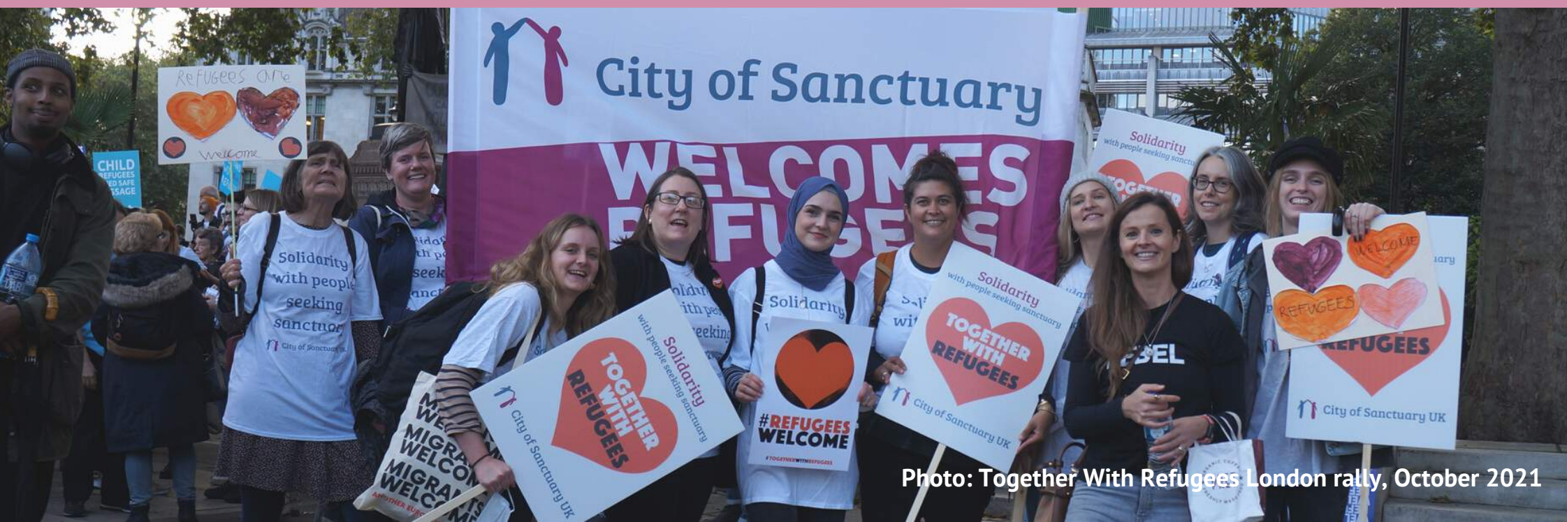
Photo: Together With Refugees London rally, October 2021

We're there every step of the way. From practical training and resources to unmissable webinars and collaboration opportunities, we do all we can to support this network of welcome.