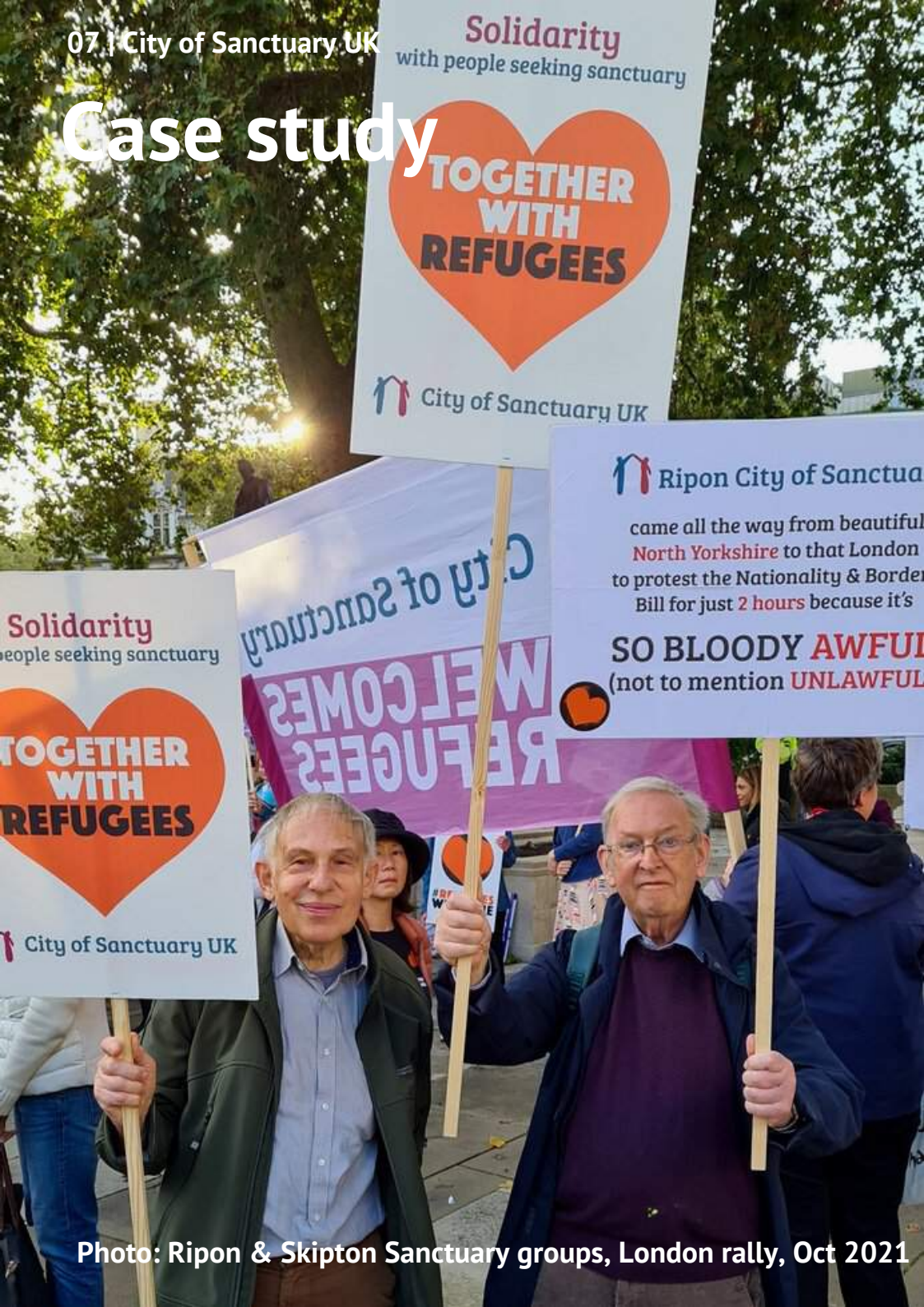
Photo: Ripon & Skipton Sanctuary groups, London rally, Oct 2021