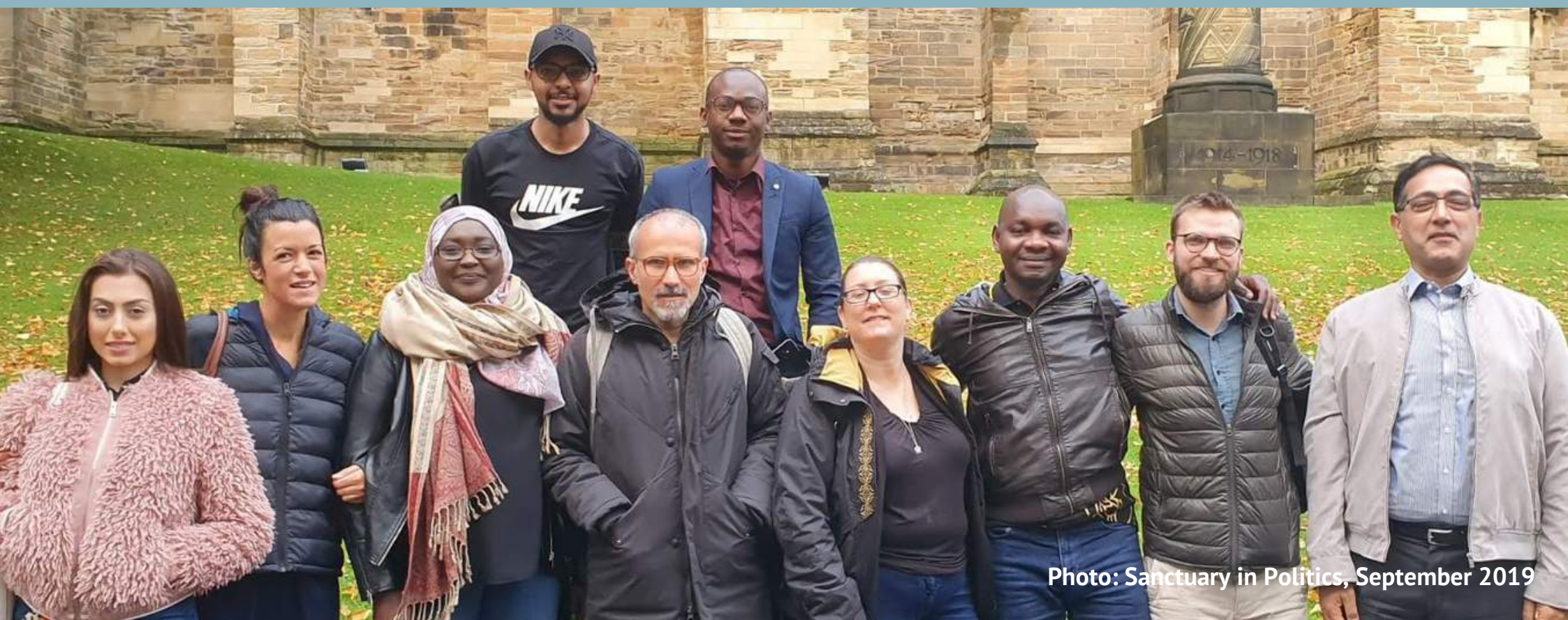
Photo: Sanctuary in Politics, September 2019

Guided by experts in the field, this course helps equip a new generation of refugee and migrant leaders to reach their full potential. The ultimate aim is for a new generation of Sanctuary Ambassadors to be empowered and equipped to bring the voice of people who seeking sanctuary into mainstream society. The Ambassador network is a vibrant, inclusive and creative team of advocates passionate about building a culture of welcome and encouraging others to join the movement for a fair, effective and humane asylum system.