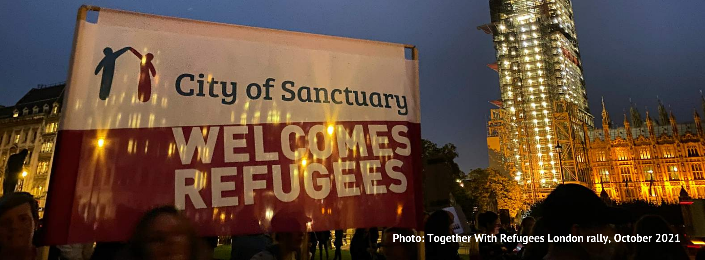
Photo: Together With Refugees London rally, October 2021

This year saw the government's new Nationality and Borders Bill, a proposed overhaul of the asylum system that could be one of most significant roll backs of refugee rights that this country has ever seen. As members of the Together With Refugees coalition, we are proud to mobilise and empower the City of Sanctuary networks to campaign for a better, fairer deal for people seeking safety. We continue to be active members of the campaign coalitions, Dentention Forum, challenging the UK's use of immigration detention; Lift the Ban, campaigning to give people seeking asylum the right to work; and Families Together, fighting for more refugee families to be reunited in the UK.