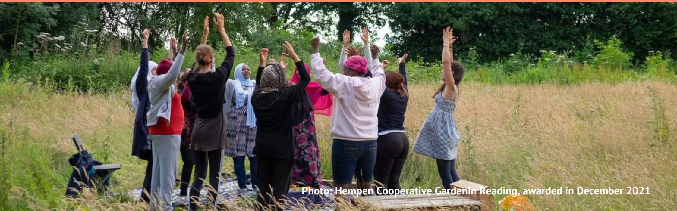
Photo: Hempen Cooperative Garden in Reading, awarded in December 2021