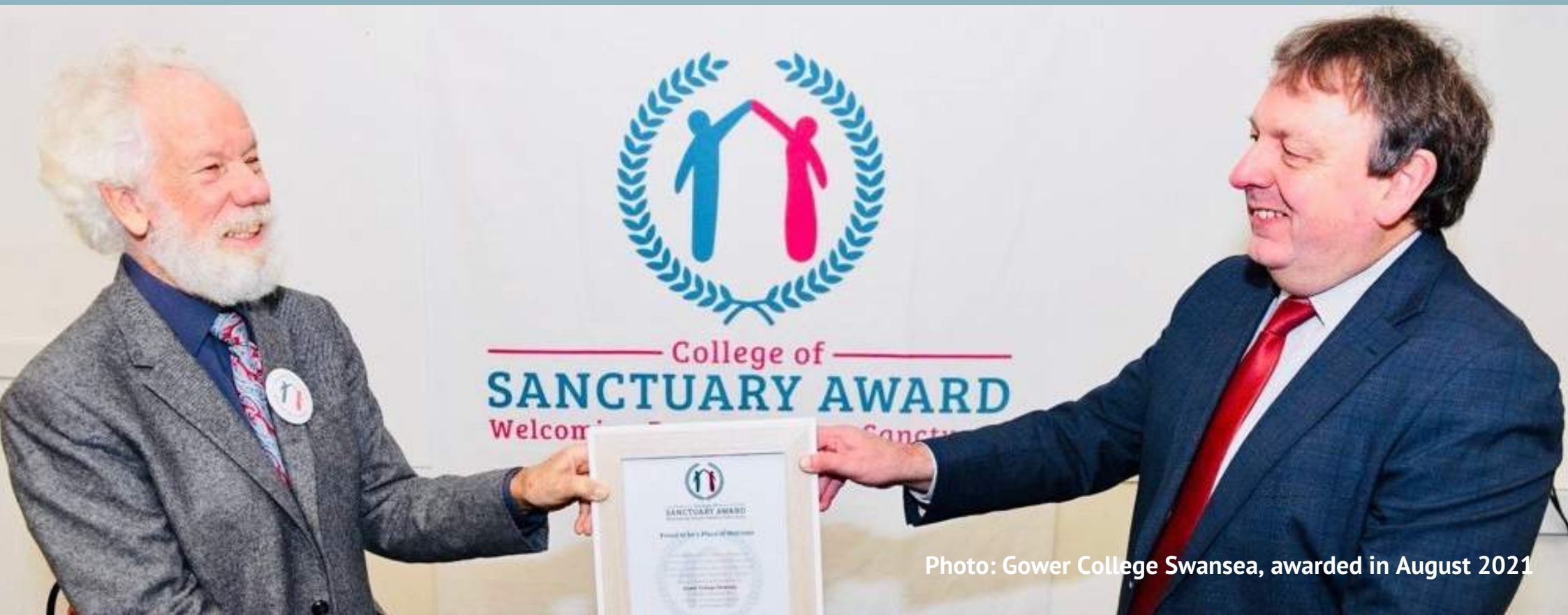
awarded in August 2021

We all have a part to play in building a more welcoming, inclusive and compassionate society. Any community group, private organisation, public sector service or other bodies which contribute towards the vision of welcome can apply for the award. Appraised by a panel including someone with lived experience of seeking sanctuary and an expert in the field, this formal awards process recognises and rewards good practice and progress within a sector, whilst encouraging other organisations to do the same.