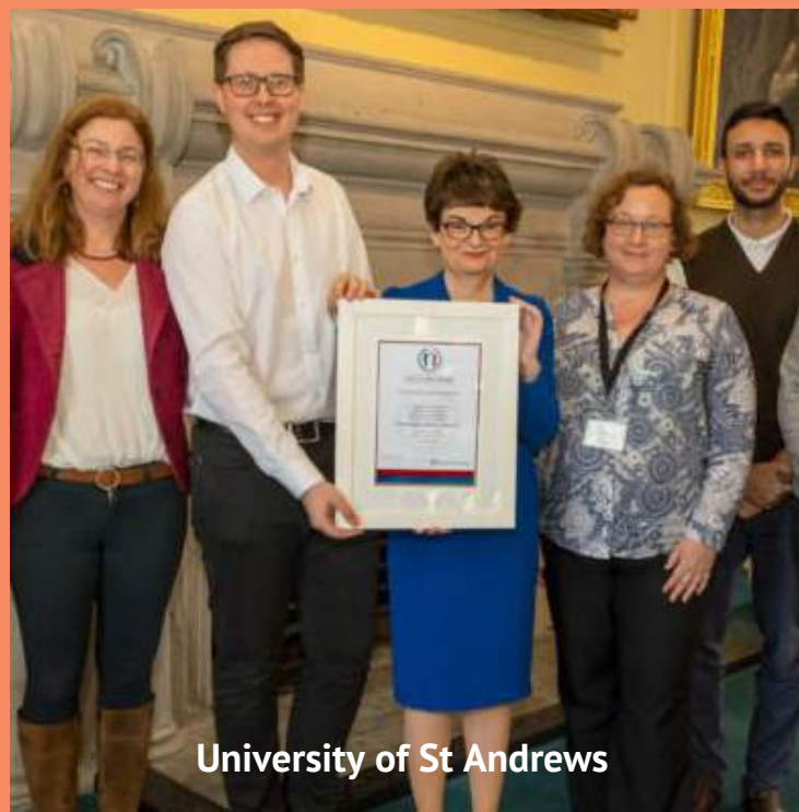
University of St Andrews

We have worked with the Scottish Refugee Council to develop specialist training for universities. This year saw University of St Andrews welcome its very first cohort of Sanctuary Scholarship holders, University of Edinburgh has been re-accredited, whilst four more Scottish universities are working towards the award.