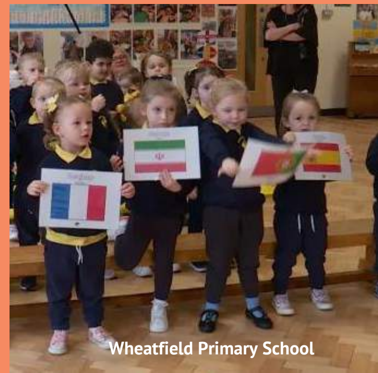
Wheatfield Primary School

Belfast City of Sanctuary has worked in partnership with Education Authority of Northern Ireland to deliver Schools of Sanctuary in the Urban Villages areas of Belfast and Derry/ Londonderry. 2021 saw the 50th school in Northern Ireland being awarded with Sanctuary status.