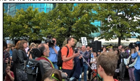
Dublin Welcomes Refugees Event